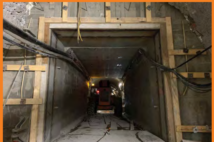
2600 Plug and the commencement of construction of the Horetzky Plug.

Landing. This plug will be 12m long and horseshoe shaped 7m wide and 7m tall. Both plugs are made of concrete and will have a 3m by 3m steel door that will allow equipment access for future maintenance. The plugs include drainpipes that can be opened by valves to empty the tunnel when and if access is required at a later date. It takes six to eight weeks to construct a plug!