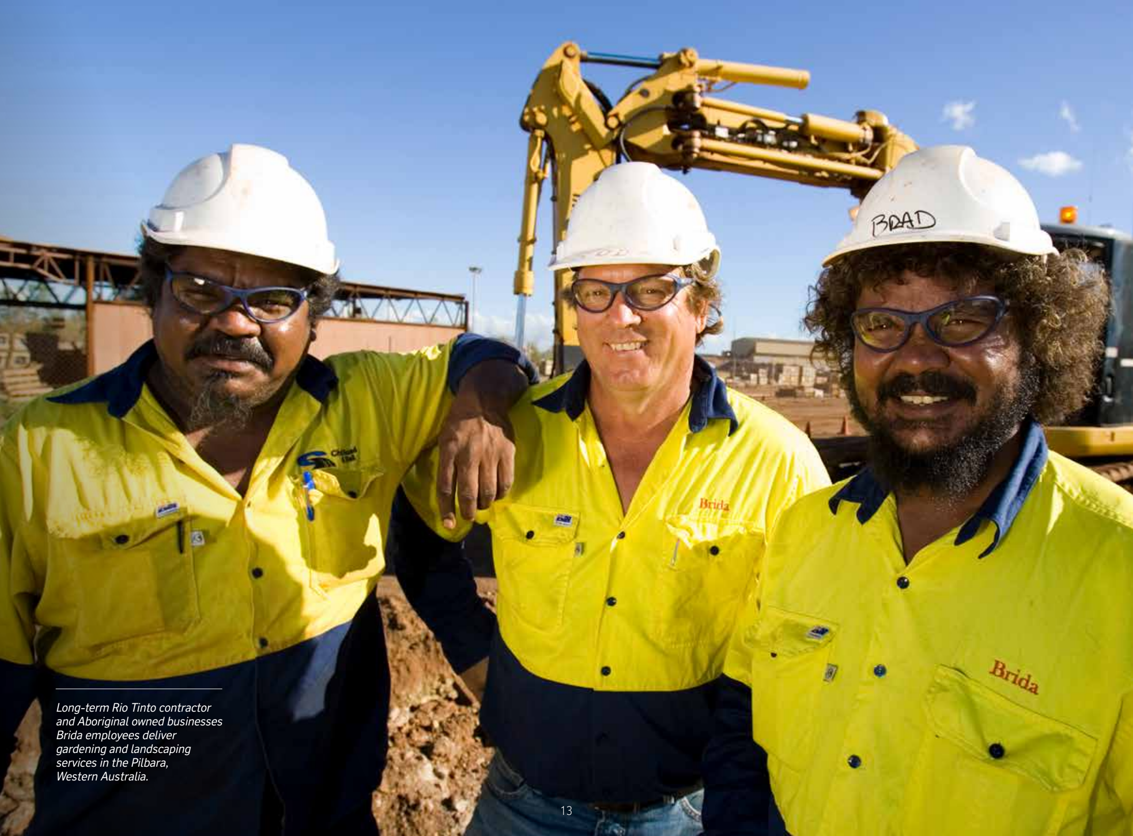
Long-term Rio Tinto contractor and Aboriginal owned businesses Brida employees deliver gardening and landscaping services in the Pilbara, Western Australia.