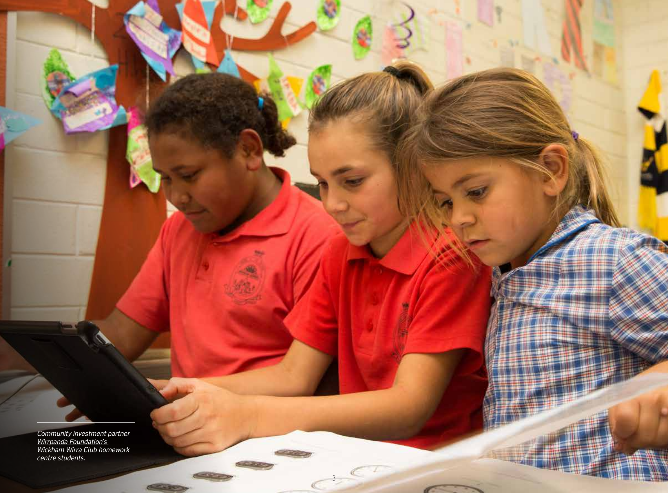
Community investment partner Wirrpanda Foundation's Wickham Wirra Club homework centre students.