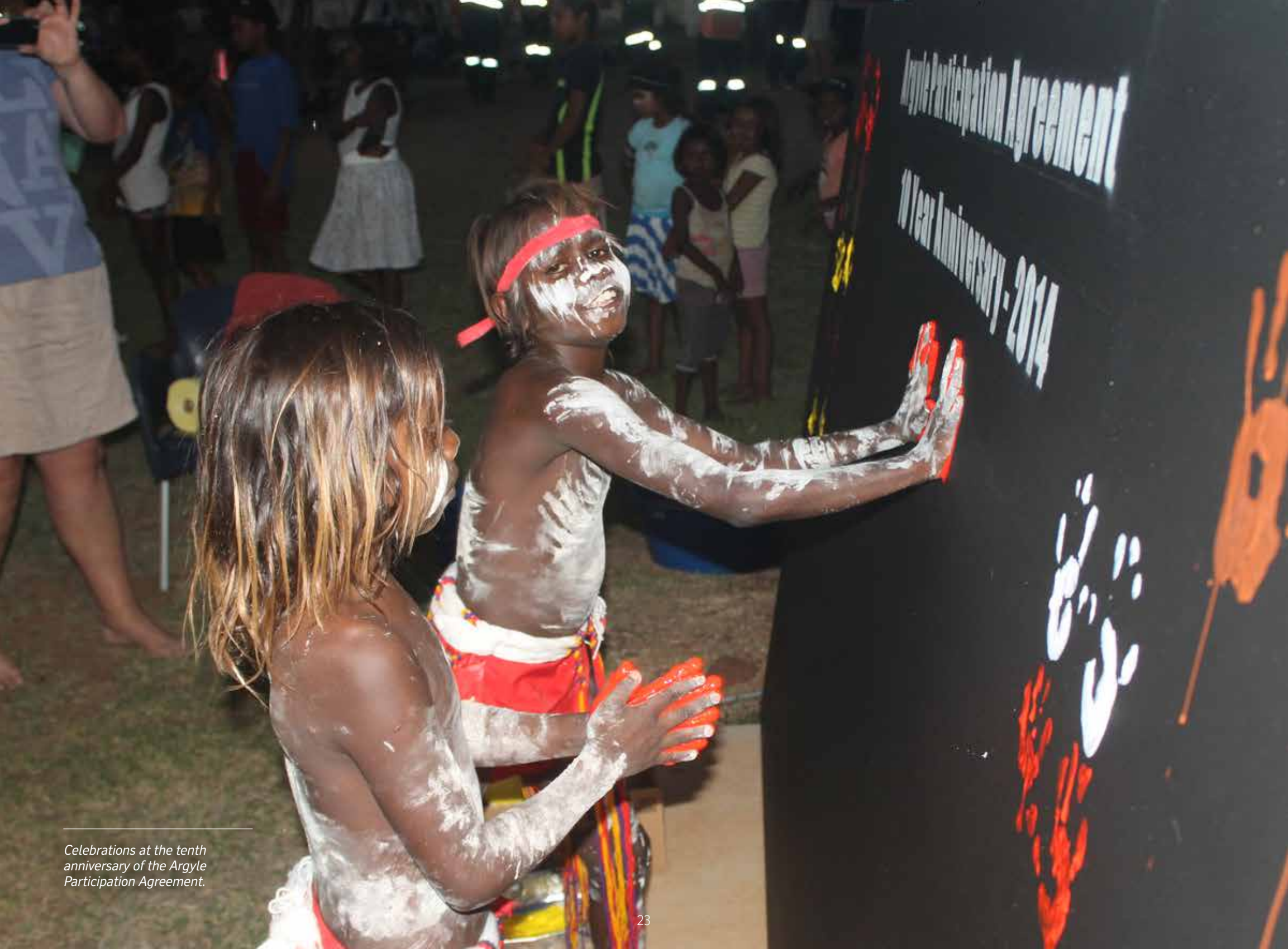
Celebrations at the tenth anniversary of the Argyle Participation Agreement.