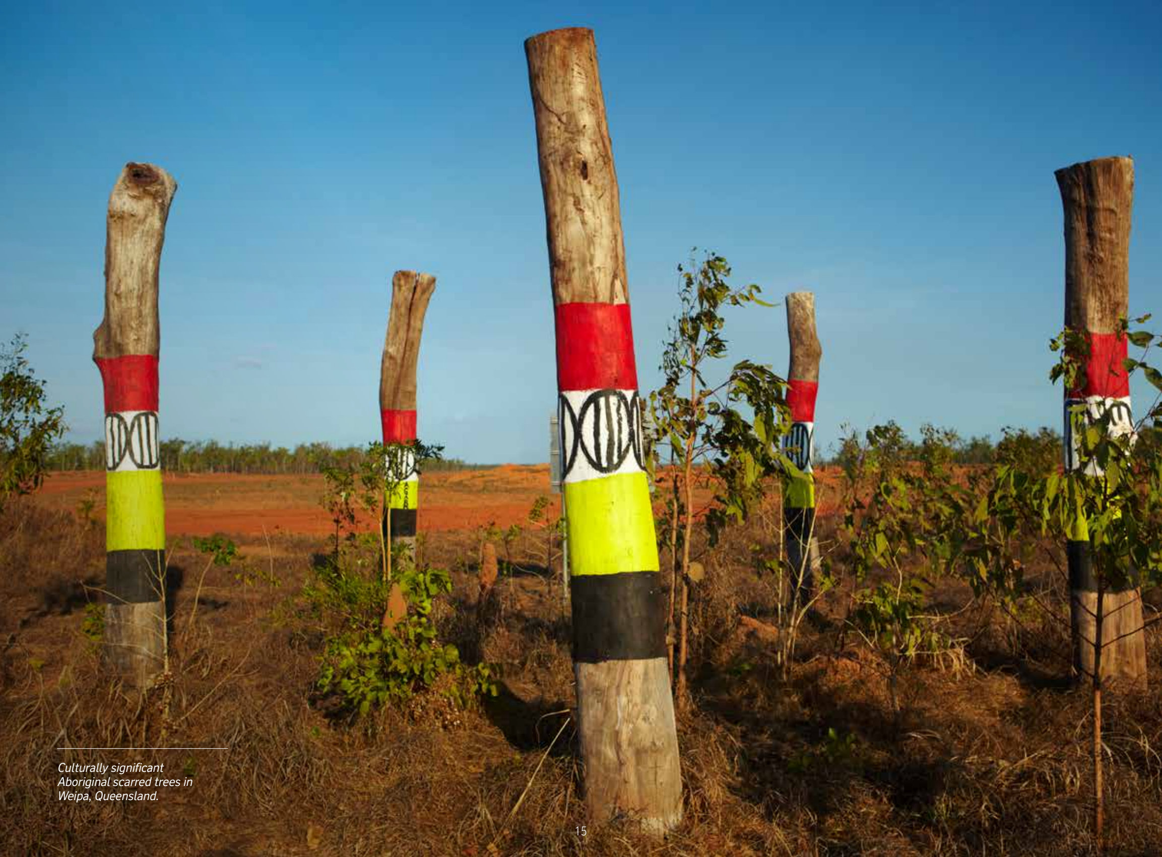
Culturally significant Aboriginal scarred trees in Weipa, Queensland.