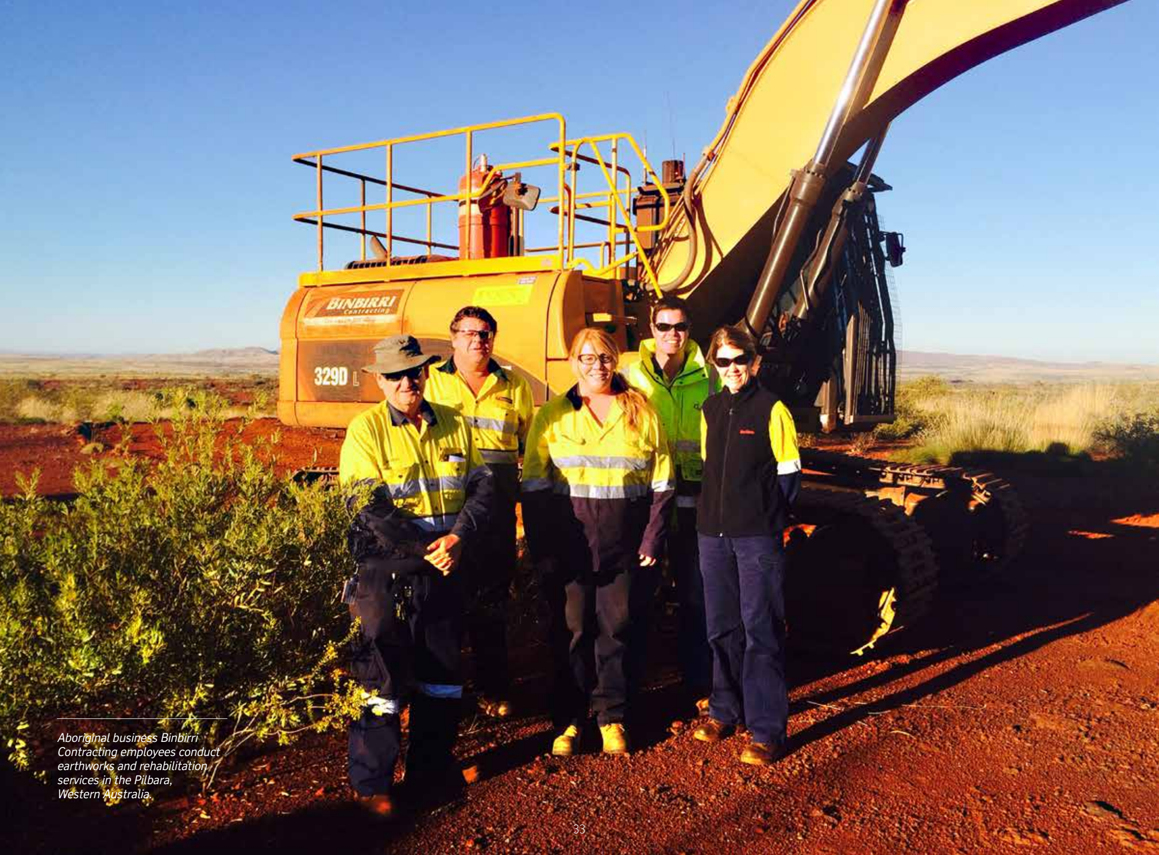
Aboriginal business Binbirri Contracting employees conduct earthworks and rehabilitation services in the Pilbara, Western Australia.