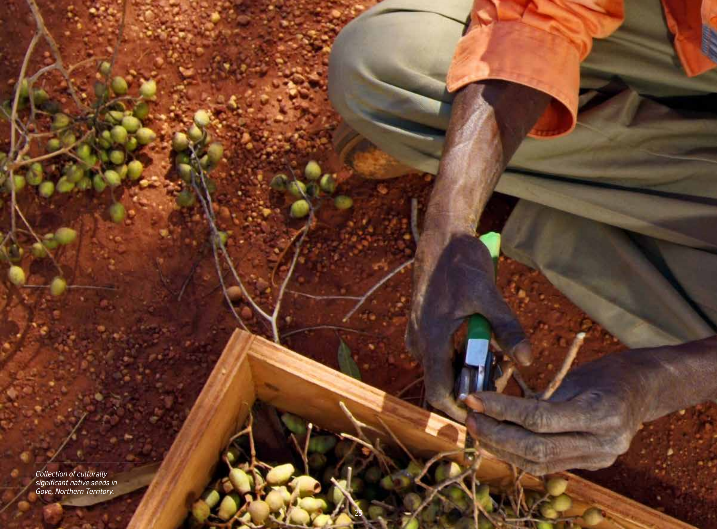
Collection of culturally significant native seeds in Gove, Northern Territory.