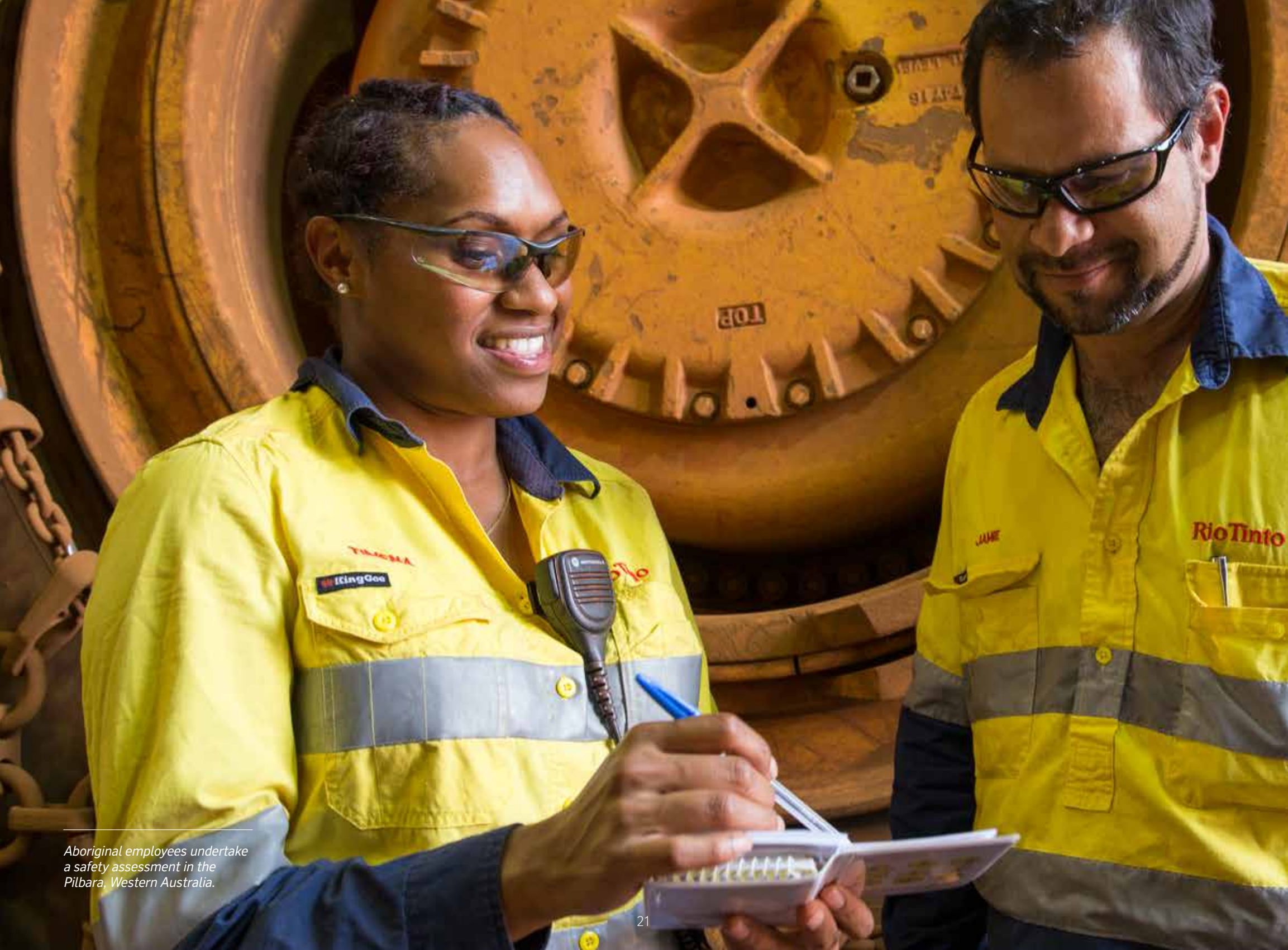
Aboriginal employees undertake a safety assessment in the Pilbara, Western Australia.