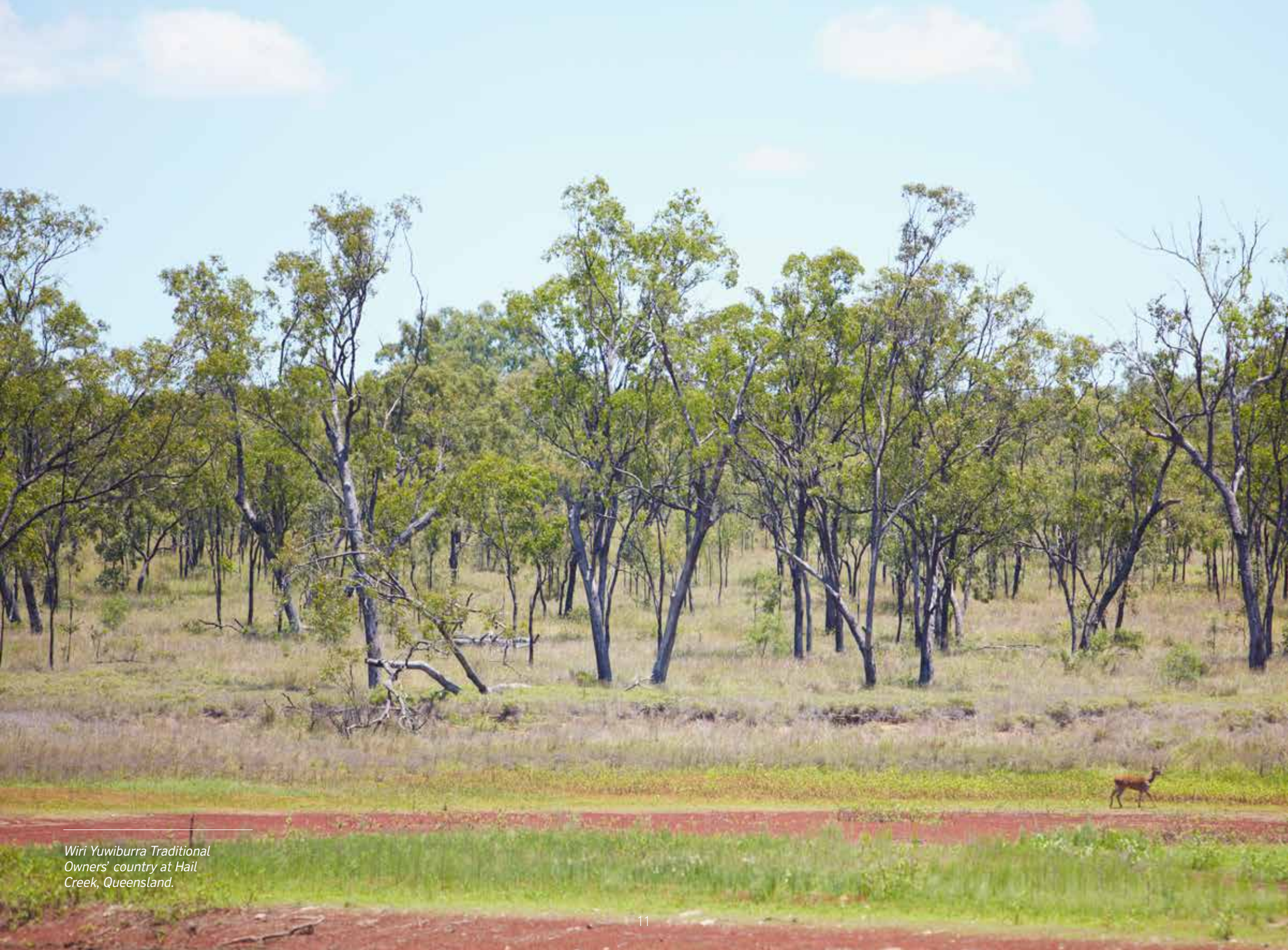
Wiri Yuwiburra Traditional Owners' country at Hail Creek, Queensland.